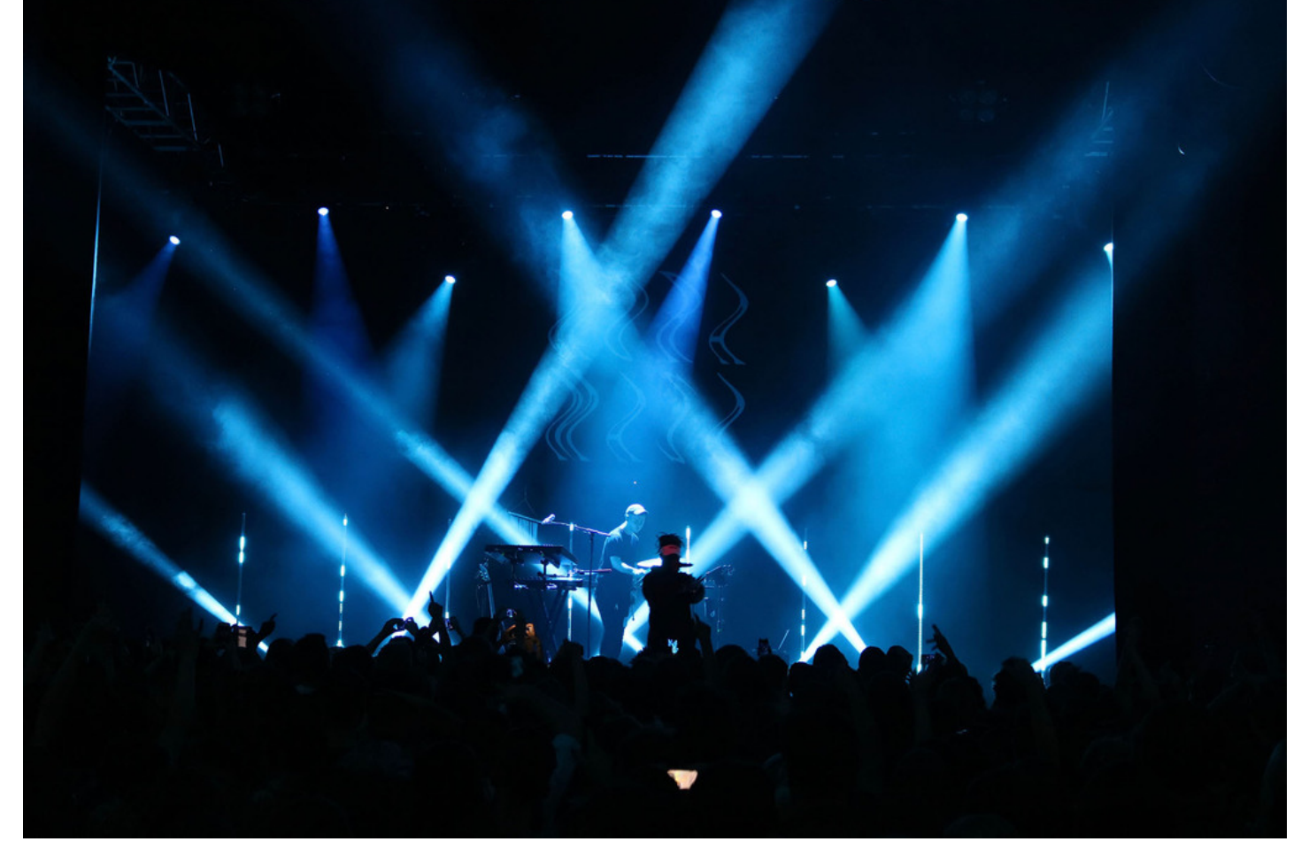
Chasing the Dragonfly with Spikies