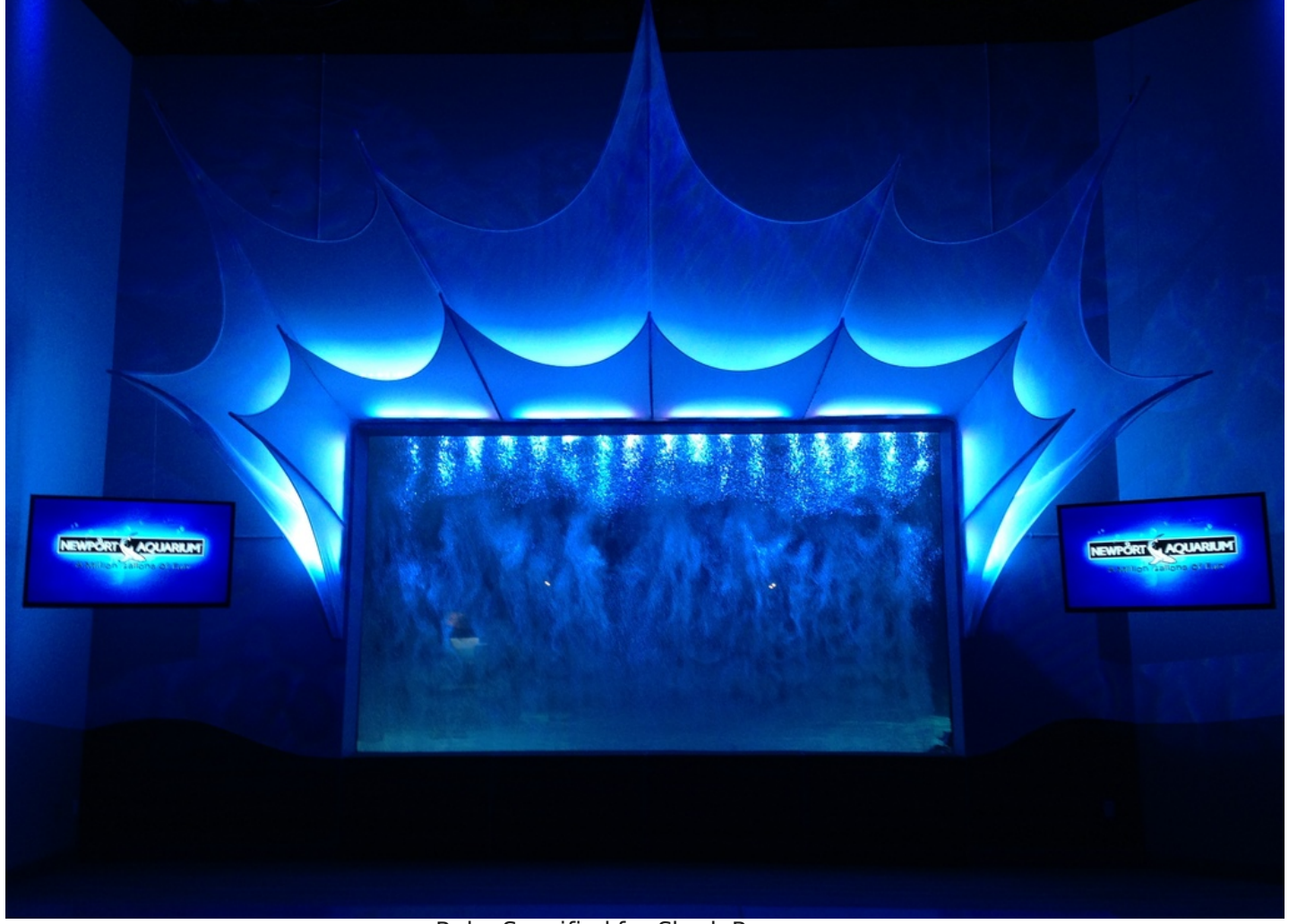
Robe Specified for Shark Ray Bay Dive Theater