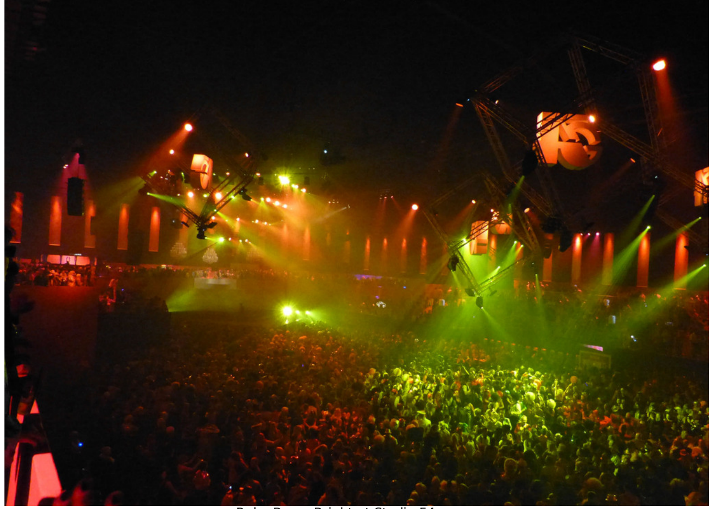
Robe Burns Bright at Studio 54 Sportpaleis Disco Inferno