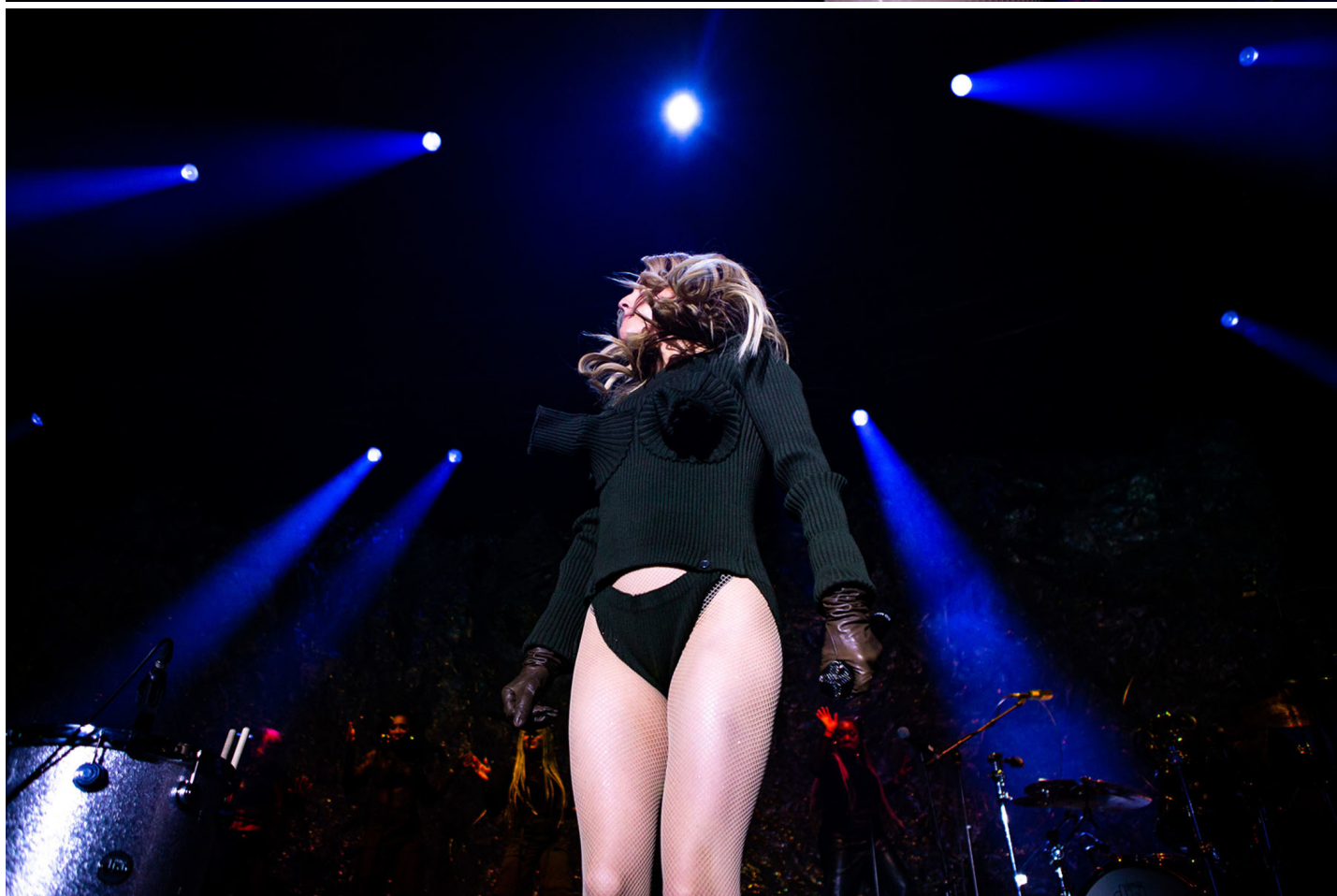
Roundhouse Rounds off All Robe Moving Light Rig with new ESPRITES