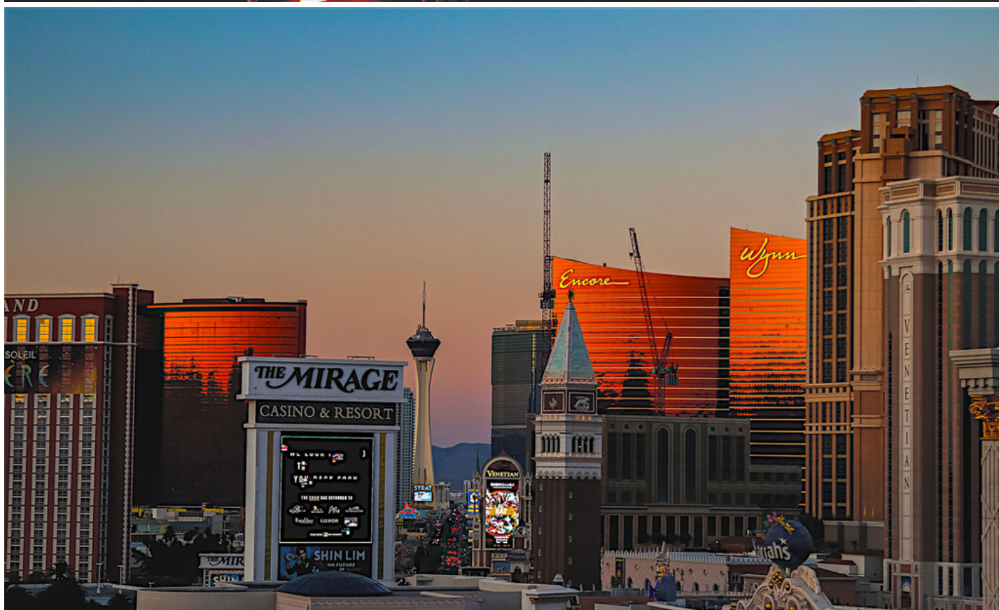
Robe Raises the Roof for The Killers Performance in Las Vegas